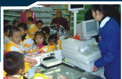
Tax control >>