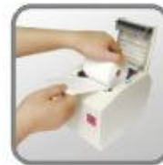
Paper Easy loading

Widely used in bill printing in lottery, supermarkets, restaurants and chain stores. etc